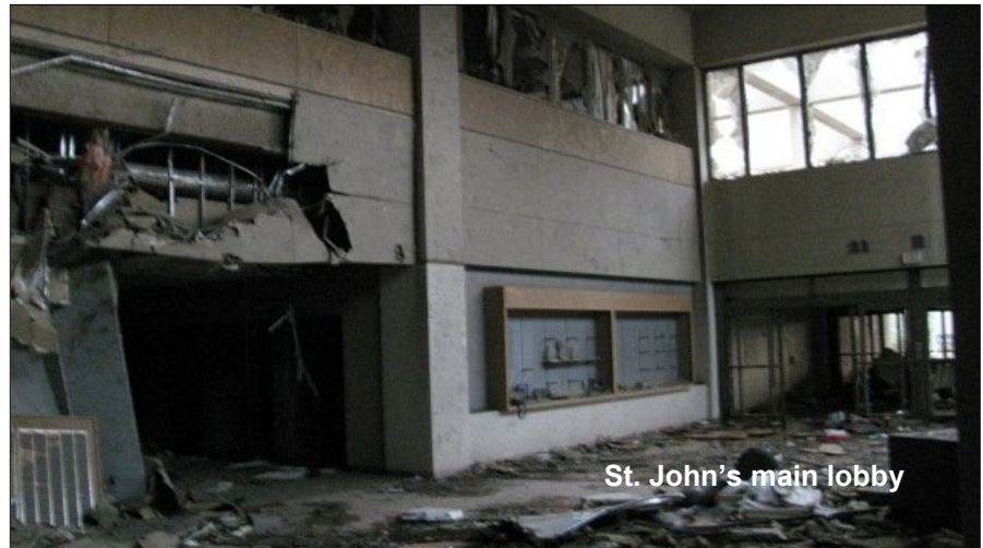
St. John's main lobby